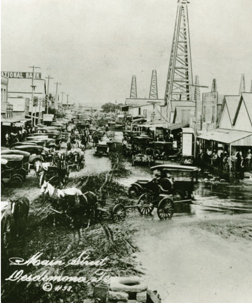
Main Street in Desdemona at the height of the oil boom in 1918, which was also when the flu pandemic struck.